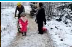
Moment Belgian cyclist knocks five-year-old girl