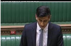
'Generation rent to generation buy':