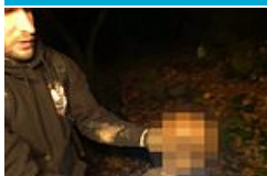
Ghost-hunting YouTubers film