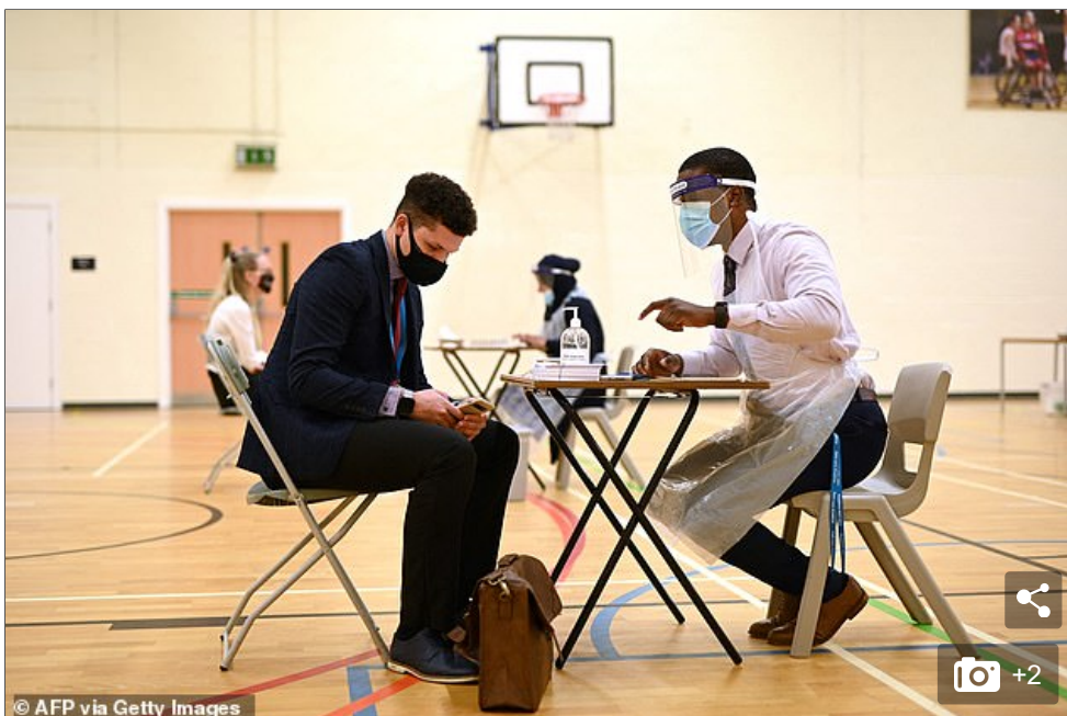
A teacher is seen above getting a coronavirus test at a school in Halifax. The Government says secondary pupils should wear masks in class – but this is not mandatory

'The idea is that you have daily contact testing, allowing people to continue at school in spite of being a contact. The pilot works if the uptake of voluntary testing is increased.'