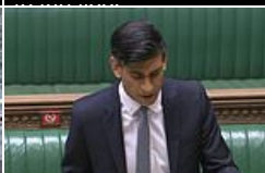
Pandemic taxes: Corporation taxes rise