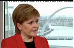
Sturgeon 2018: I didn't know before April