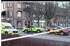
Swedish cops cordon off area at scene of