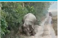
Unusual moment elephant slams face