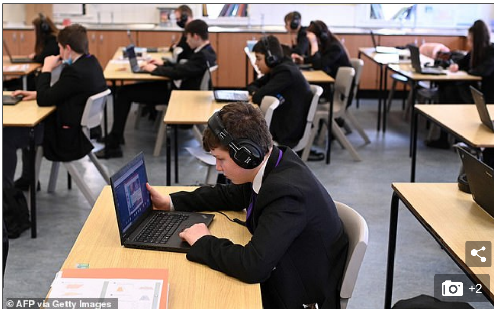
Whole classes will no longer be sent home when a single pupil tests positive for Covid, under plans being considered by ministers. Students are seen taking part in an online lesson at a school in Halifax

But researchers from the University of Oxford are now recruiting 200 secondary schools in England to try out the new system.