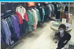
Shop employee in Greece runs as walls